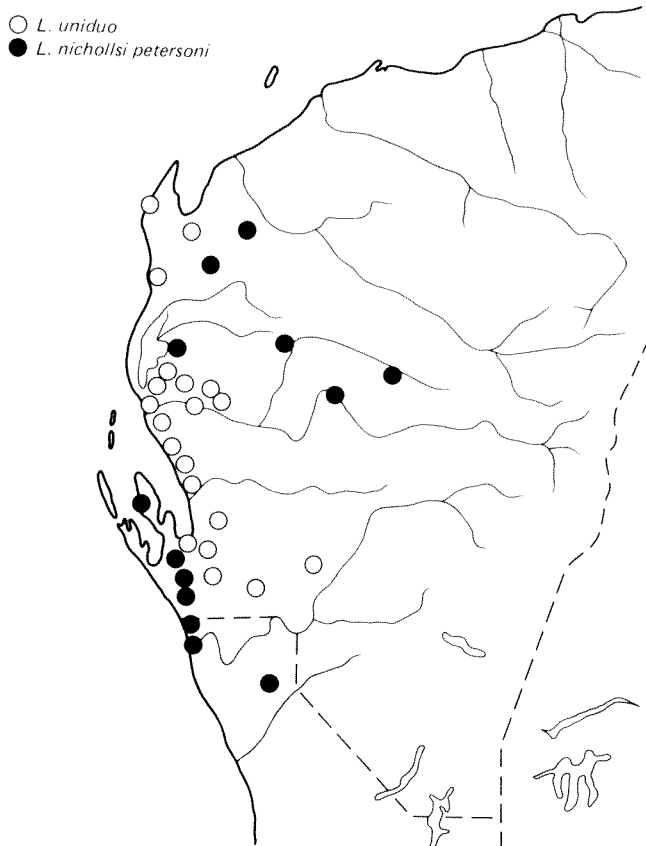
Figure 2 Map of north-western and mid-western Western Australia showing location of specimens of Lerista uniduo and L. nichollsi petersoni .