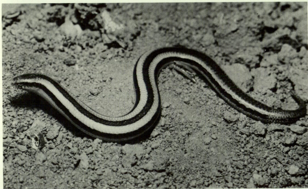
Figure 3 A Lerista nicholli nicholli from Yalgoo.

Dorsally brownish-white with a narrow vertebral stripe composed of two series of short dark brown dashes, the space between them pale to moderately dark brown. Head brown, shields with or without a fine dark brown margin. Wide, dark brown upper lateral stripe extending narrowly forwards through lore to